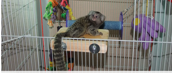
Through your actions, you will make this trade illegal