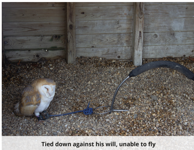
Tied down against his will, unable to fly