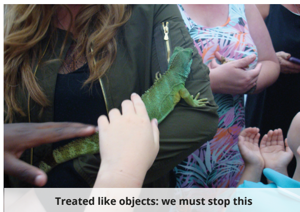
Treated like objects: we must stop this

Last year, legislation came into force in England forcing mobile zoos to be licenced.