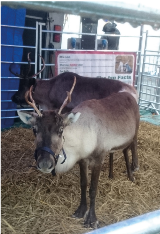
Thanks to you, we are ready to fight for their freedom

Hopefully this is just the beginning and we will soon see future actions for other species who are still being caught for the zoo trade.